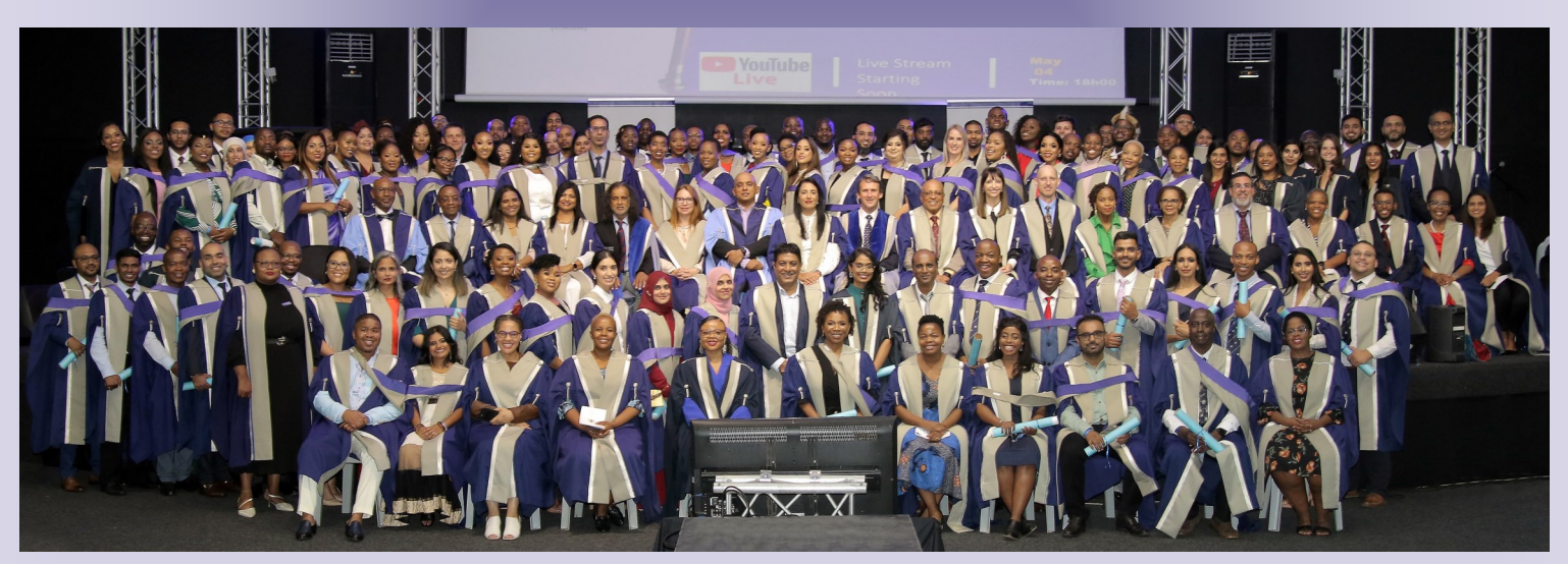
Graduates and CMSA Senators, Executives and Distinguished guests at the Durban Admission Ceremony on 4 May 2023

He continued by saying that the medical profession is one of sacrifice and that medical professionals could not fear death. "If you are scared to die in the medical field – go find something else to do. In this field you are challenged, and your life is at risk. COVID showed you that, HIV showed you that, TB showed you that, Ebola showed you that. If you are afraid to die, find